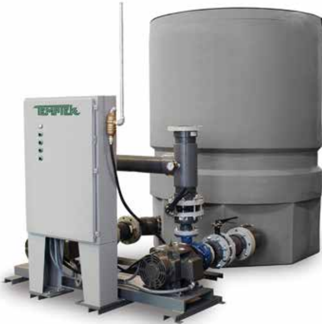
PPT-1500-3P shown with these optional features: