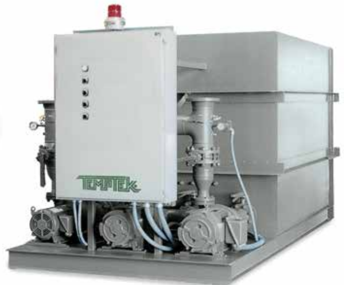
PT-2000 shown with optional features: